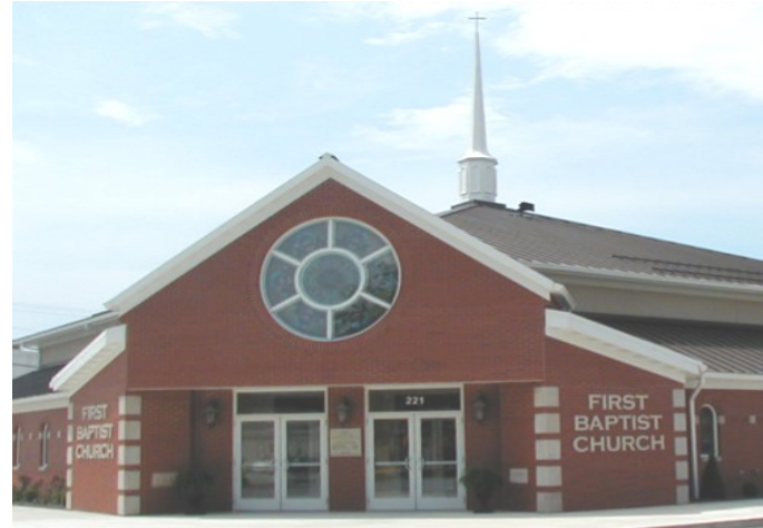
First Baptist Church