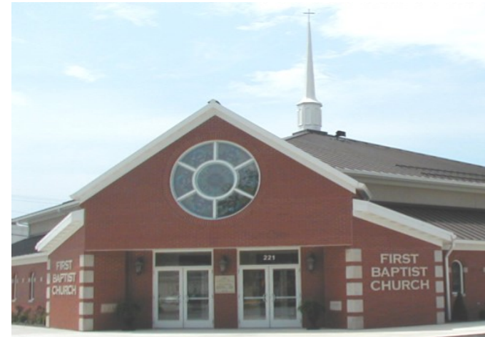
First Baptist Church