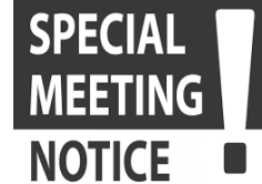
First Baptist Church~221 North Main Street, Monroe City, MO~573.735.2635~office@fbcmonroecity.org~www.fbcmonroecity.org

Special Called Business Meeting Immediately following our morning worship service on July 4th we will have a special called members meeting to vote on our pastoral candidate.