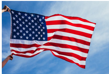
First Baptist Church~221 North Main Street, Monroe City, MO~573.735.2635~office@fbcmonroecity.org~www.fbcmonroecity.org